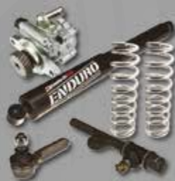
STEERING & SUSPENSION