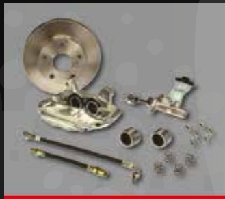
BRAKE & CLUTCH