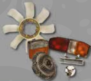
ENGINE, BODY & ELECTRICAL

ustralia & New Zealand. The range consists of high quality 4x4 makes and models at a competitive price.